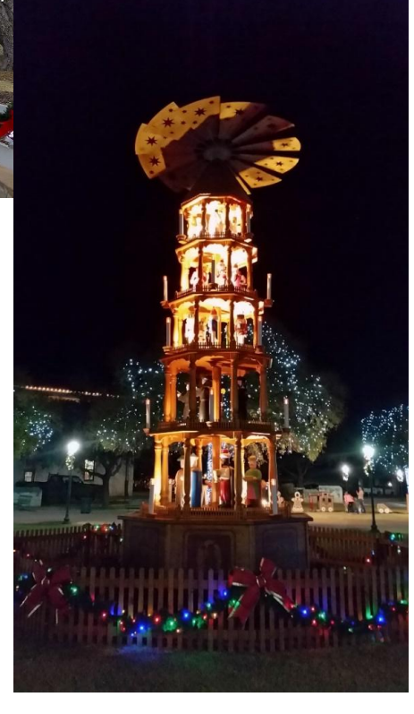
Later, they headed to Luckenbach.